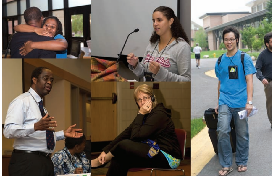
With hugs and anticipation, delegates arrive for the Uniting General Council.