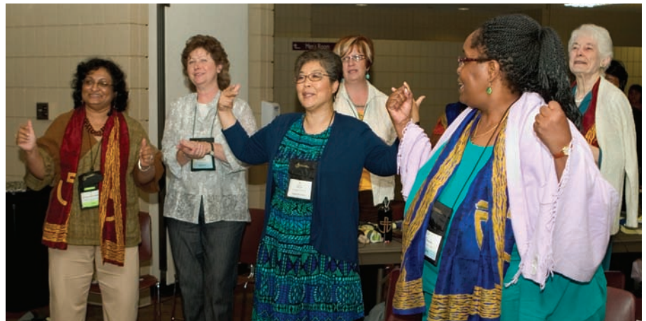
Delegates in the Women’s Pre-Council sing songs of celebration.

While the women were praising God and doing serious business, the youths were at work too.