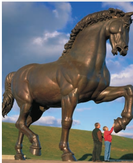
A giant bronze horse designed by Leonardo da Vinci is a favorite attraction at Frederik Meijer Gardens & Sculpture Park near Calvin College.

The one visit that I am going to try to fit in